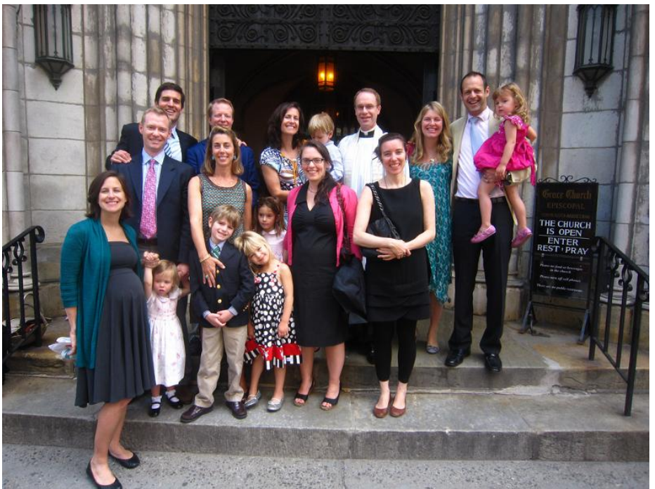
Some of the five baptism candidates paused for a picture on the church steps after the 9 a.m. service on May 2nd.